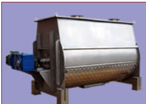
Mixer mod MA/1 2000 lt in stainless steel with thermic jacket