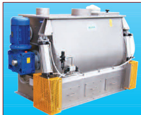
Mixer with pneumatic bomb door release for quick discharge