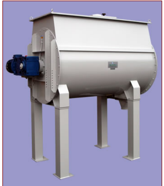
MA/1 – Lt. 2000 in painted carbon steel