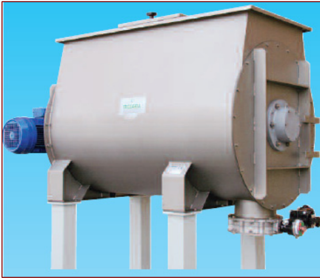
MA/1 – Lt. 1000 in stainless steel